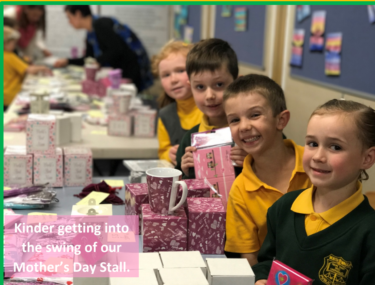
Kinder getting into the swing of our Mother's Day Stall.

💻: www.northwagga-p.schools.nsw.edu.au 📧: northwagga-p.school@det.nsw.edu.au