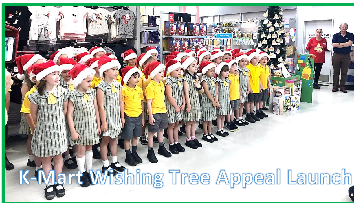
K-Mart Wishing Tree Appeal Launch

If you would like additional information, please refer to the Department of Health website https://www.health.nsw.gov.au/Infectious/factsheets/Pages/viral-gastroenteritis.aspx